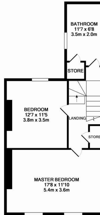
1ST FLOOR APPROX. FLOOR AREA 509 SQ.FT. (47.3 SQ.M.)

TOTAL APPROX. FLOOR AREA 1026 SQ.FT. (95.4 SQ.M.)